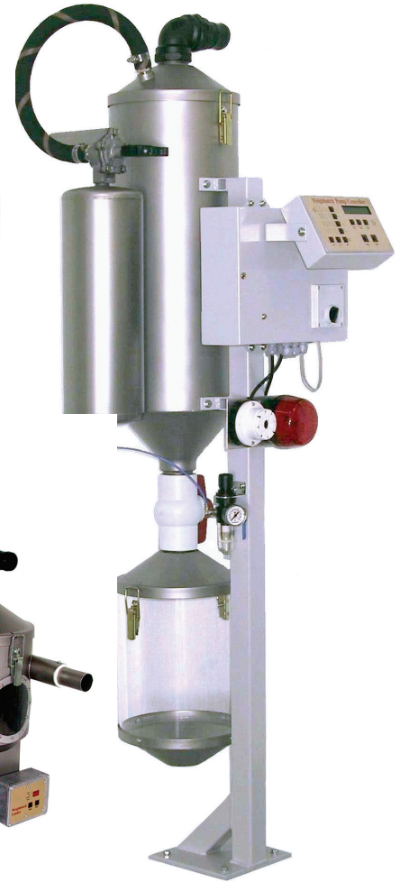
Filter & Controller