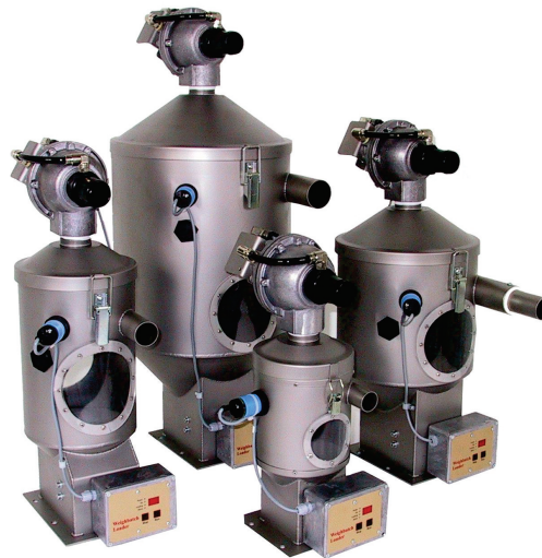
Group of different size vacuum loaders